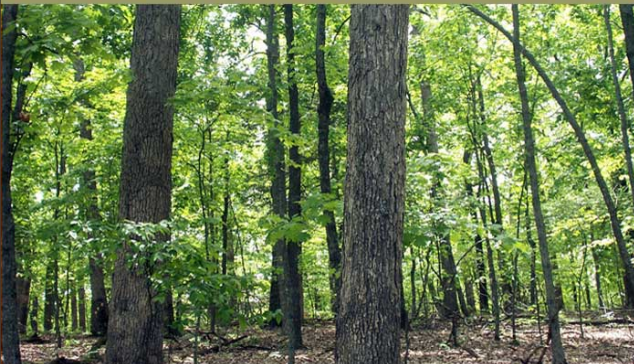
Large White Oak