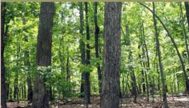
Large White Oak