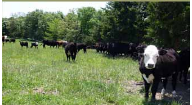
Cattle Grazing in Pasture