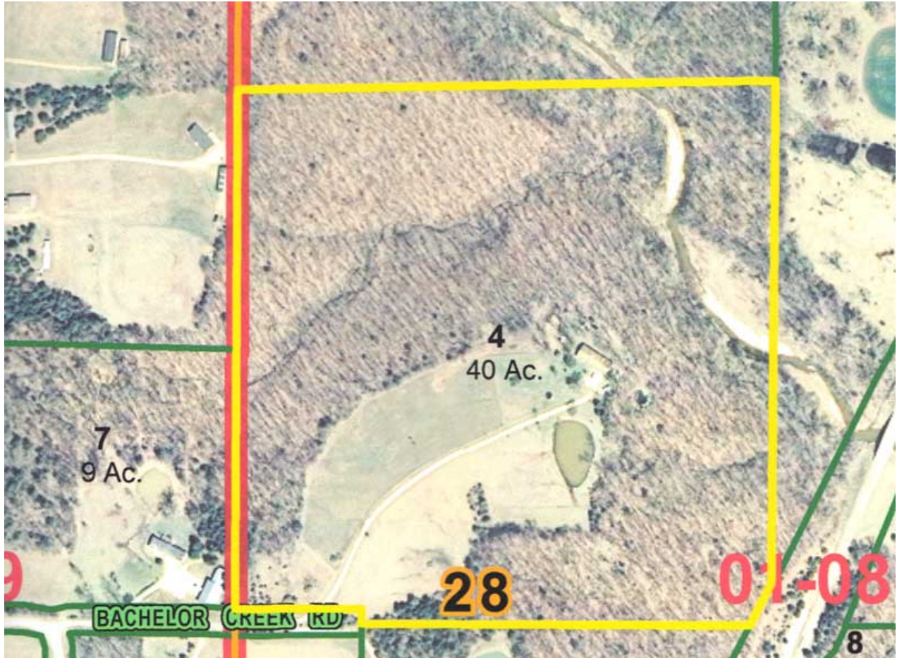
40 Acres in Callaway Co., MO - Aerial photo