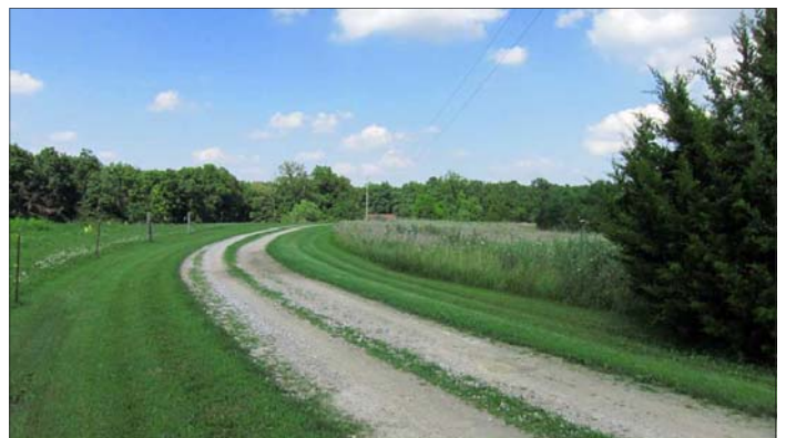
40 Acres in Callaway Co., MO - private driveway to the home