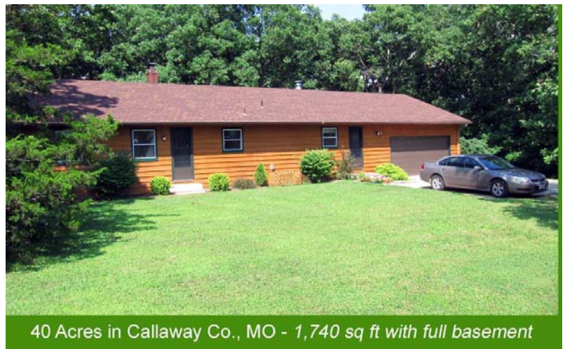
40 Acres in Callaway Co., MO - 1,740 sq ft with full basement