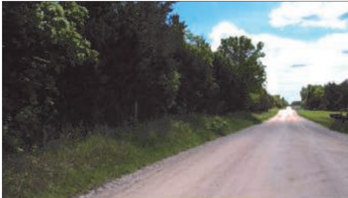
47 Acres - Callaway County 1/2 mile of county road frontage