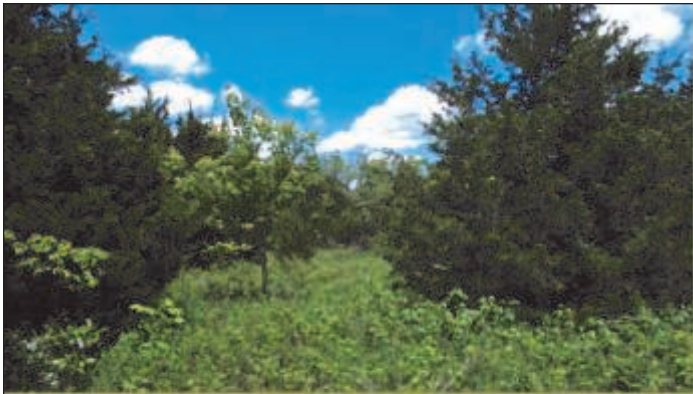
47 Acres - Callaway County Open areas - good place for food plots