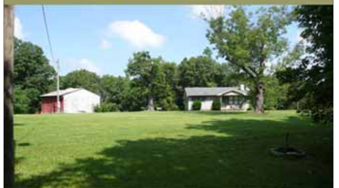
Home & Older Barn