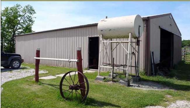
30 ft x 50 ft Enclosed Shop/Storage