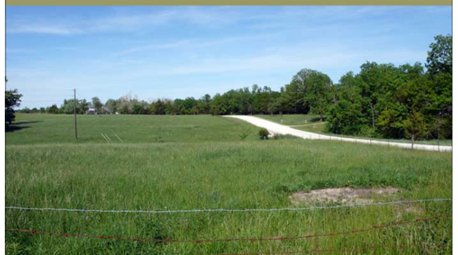
Level & Gently Rolling Pastures