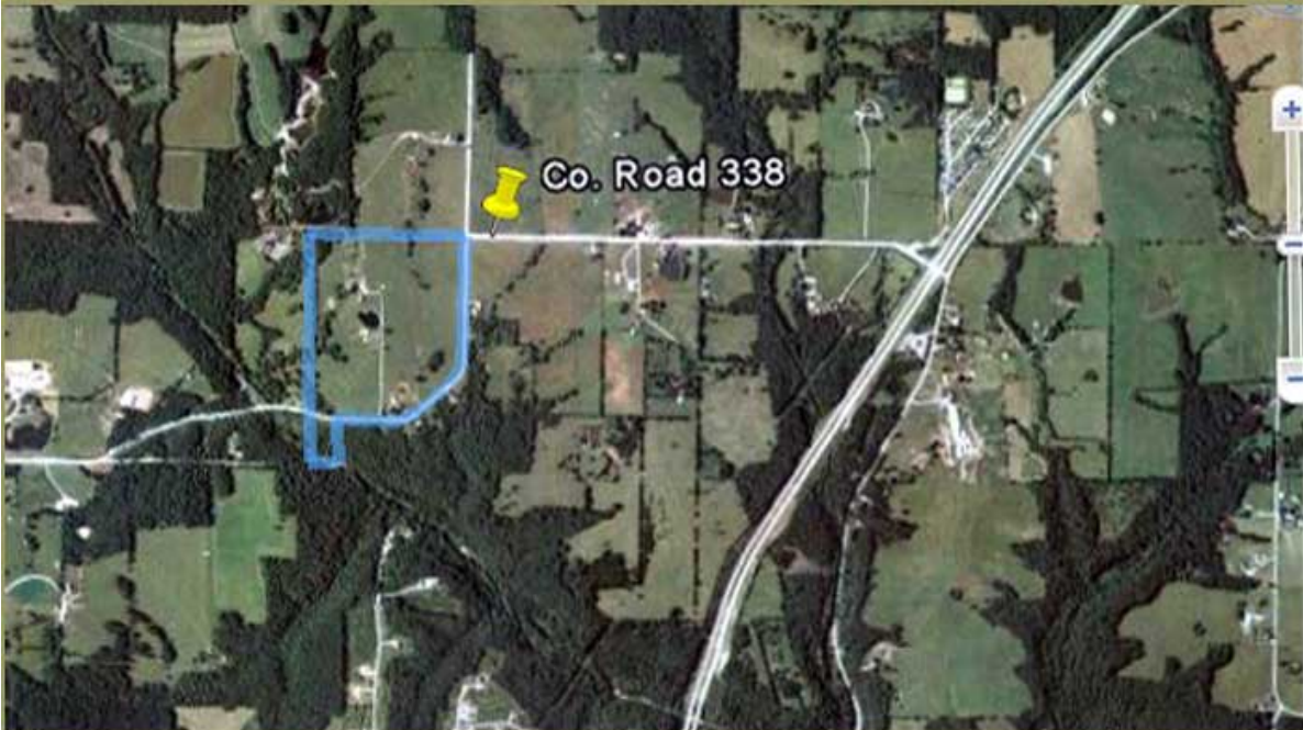
Aerial View of 78 Acres & Surrounding Area