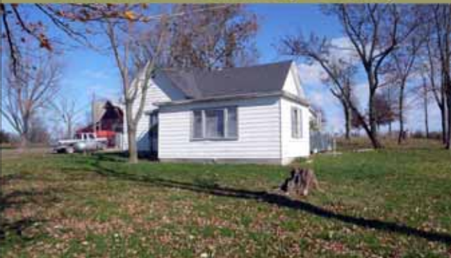
Home - Poor - Fair Condition