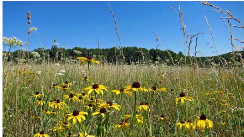
111 Acres - Franklin County 40 Acres of hay/grass fields

The creek is a winding stream along the south border with majestic rock ledges along the banks.