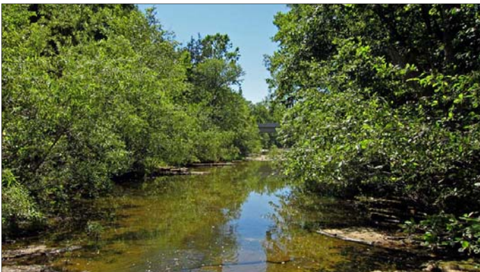
111 Acres - Franklin County Big Creek along south boundary