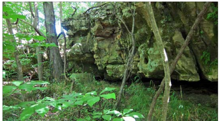
111 Acres - Franklin County Rock formation along bluffs of Big Creek