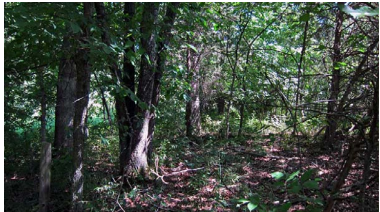
111 Acres - Franklin County 66 acres of woods