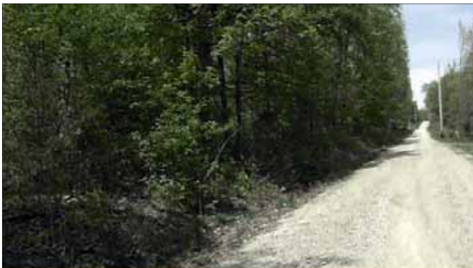
42 Acres - Franklin County Novak Road, a private road leads from highway 50 to this 42 acres

From Union, travel west for 20 miles on highway 50 through Leslie and Gerald. About 1 mile west of Gerald, turn south on Novak (a private road.) Property located one-quarter mile south of highway 50.