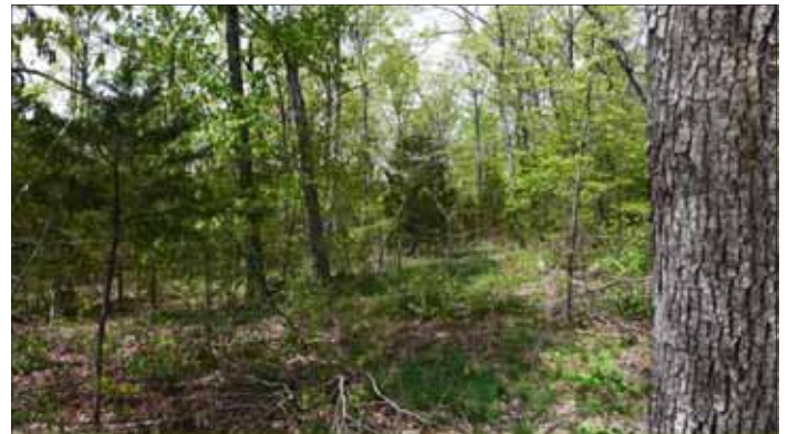
42 Acres - Franklin County Woods and pathways