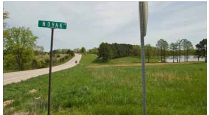
42 Acres - Franklin County From Novak/highway 50: The town of Gerald is 2 miles east, Union is 20 miles east and 270/44 is 56 miles east