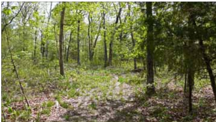
42 Acres - Franklin County Gently sloping wooded paths