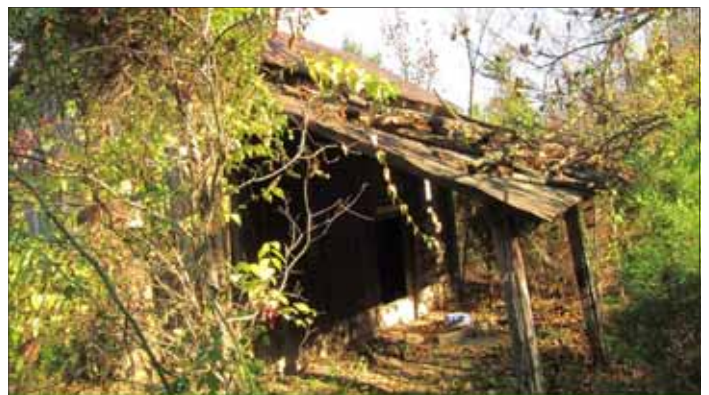
6 Acres in Franklin Co., MO - not a fixer uper