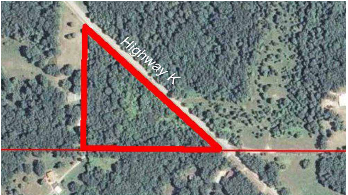
6 Acres in Franklin Co., MO - aerial photo