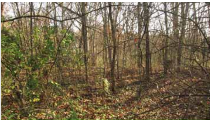
6 Acres in Franklin Co., MO - small and large trees