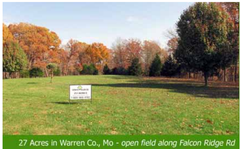
27 Acres in Warren Co., Mo - open field along Falcon Ridge Rd

Brief Description - Section 15 Twp 46 N R 3 W