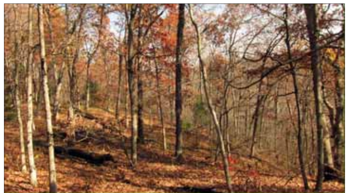
27 Acres in Warren Co., Mo - hillsides