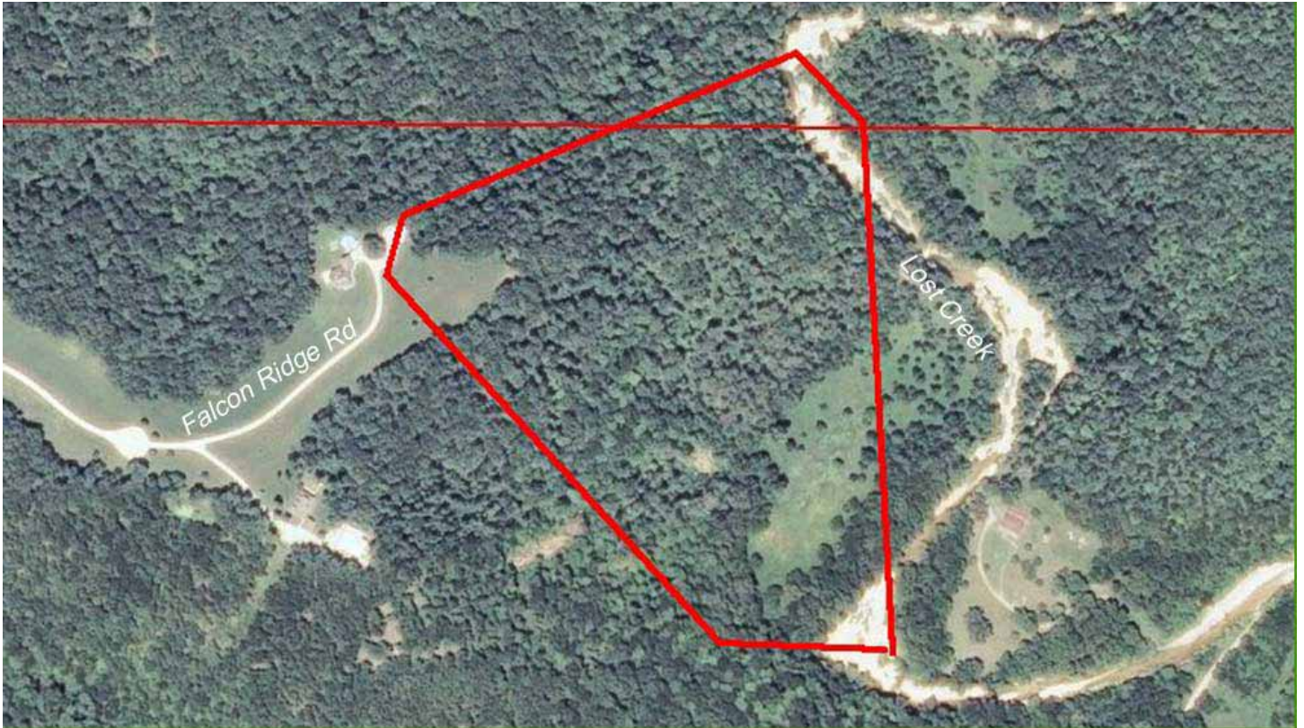
27 Acres in Warren Co., MO - Aerial photo