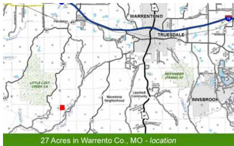
27 Acres in Warrento Co., MO - location

Driving Directions From Warrenton travel 6.5 miles to State Highway B. Exit south 5.9 miles to State Highway EE. Continue on EE .6 of mile to Low Gap Road. Low Gap Road becomes Jacks Cabin Road and continue .5 of a mile to Falcon Ridge Road to property.