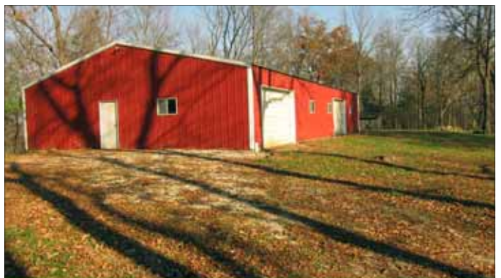
34 Acres & home in Warren Co., MO - 40ft x 72ft enclosed building