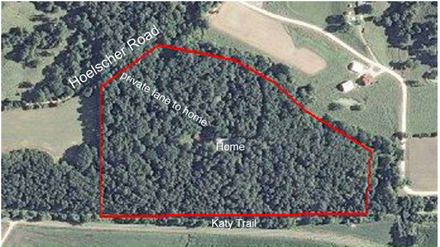
34 Acres & home in Warren Co., MO - aerial photo