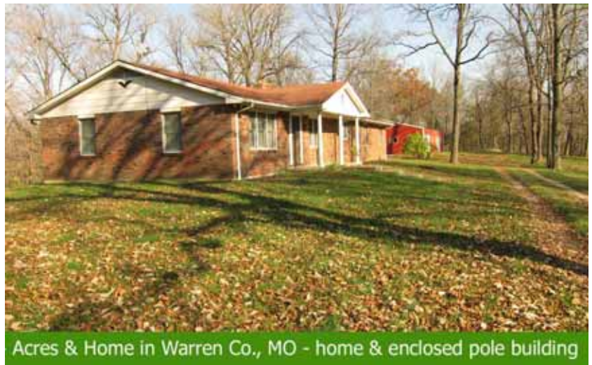
Acres & Home in Warren Co., MO - home & enclosed pole building