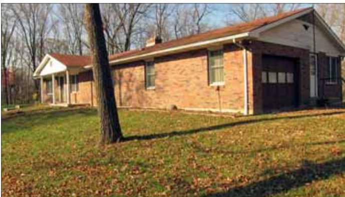
34 Acres & Home in Warren Co., MO - 3 bedroom room/central air/electric heat