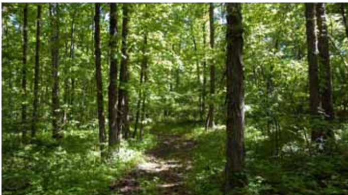
86 Acres - Warren County Paths through the level to gently rollings woods