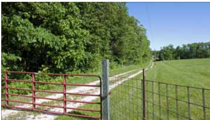
86 Acres - Warren County Gate entrance at Highway W Private lane leads from Highway W to the home near center of this 86 acres