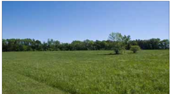
86 Acres - Warren County 8.84 acres - south field Grass/hay field