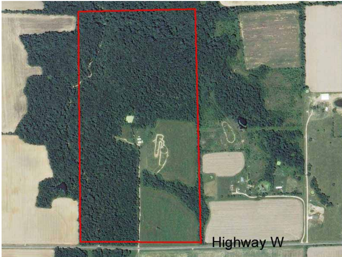
86 Acres - Warren County Aerial Photo