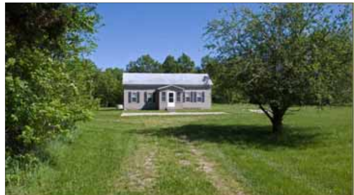
86 Acres - Warren County Private setting